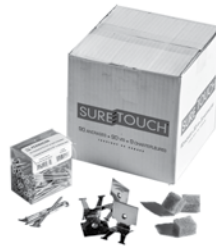
Kit 90 - anchors, screws, weep