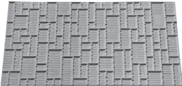
Polystyrene panel 50 x 1219 x 2438 mm - 2 x 48 x 96 in