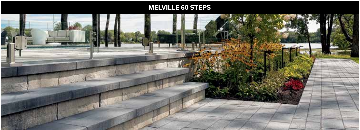
MELVILLE 60 STEPS

To build Melville Plus 60 stairs, we suggest using Melville Plus 60 units combined with Melville Tandem Plus 180 units used as risers, as shown here: